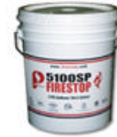
5100SP – Endothermic Spray